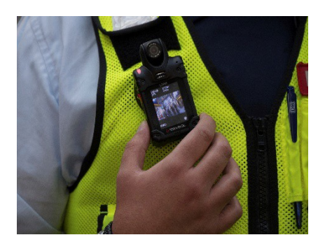
Image 2. Small wearable camera

Many consumer products have practical applications in small and large businesses. Ensuring these products will operate safely in workplaces begins with using batteries, chargers, and associated equipment that are tested in accordance with an appropriate test standard (e.g., UL 2054) and, where applicable, certified by a <u>Nationally Recognized Testing Laboratory (NRTL).</u><sup>1</sup> Manufacturer's instructions provide procedures for use, charging, and maintenance that is specific to each device and necessary to prevent damage to the lithium batteries (See Image 1). For example, some batteries will overcharge if a charger is used that does not turn off when the battery is fully charged.